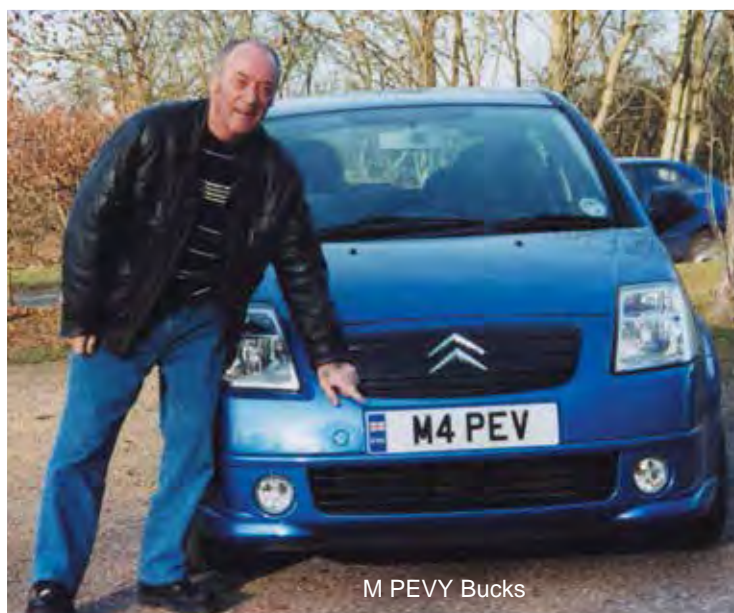
M PEVY Bucks