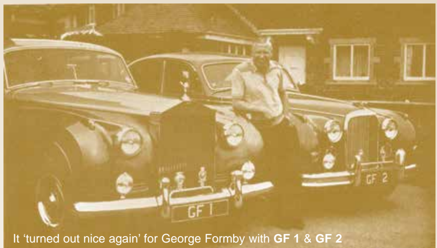
It 'turned out nice again' for George Formby with GF 1 & GF 2