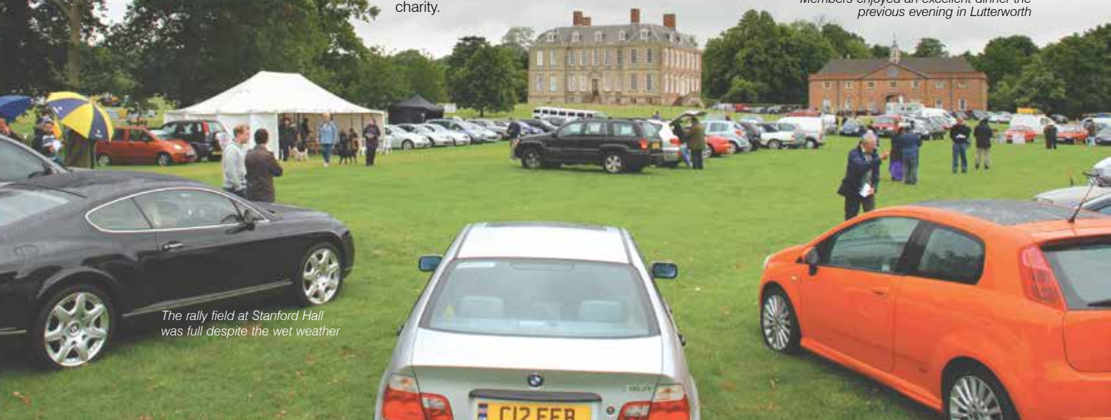
The rally field at Stanford Hall was full despite the wet weather