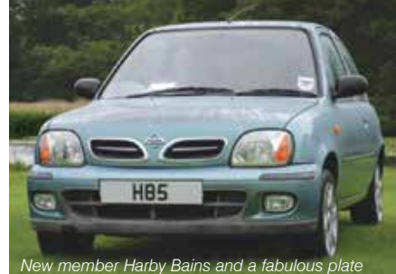
New member Harby Bains and a fabulous plate

Sadly the rain persisted for most of the morning, but by early afternoon the sun came out and the rally site, adjacent to Shakespeare's river Avon, dried up fairly quickly allowing members to picnic and just generally meet up with old acquaintances and chat with other like minded people about our shared interest. The prize giving commenced around 3.30pm followed by a prize draw with some great items which had all been donated from a variety of sources. Prior to this, a special charity auction was held for a strictly one-off copy of Noel Woodall & Brian Heaton's latest 2008 publication, Car Numbers - Then and Now , which had been beautifully leather bound and gold foil edged. Brian auctioned this with great vigour and bidding was fast and furious, the book being eventually sold to a long standing club member for £125. The proceeds from this will be donated to the Parkinson's Disease Society. Sadly Noel, who many will have met at earlier rallies, is now suffering from this debilitating illness. Lloyds TSB will match the amount raised for the charity.