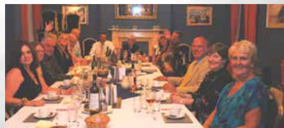
Members enjoyed an excellent dinner the previous evening in Lutterworth