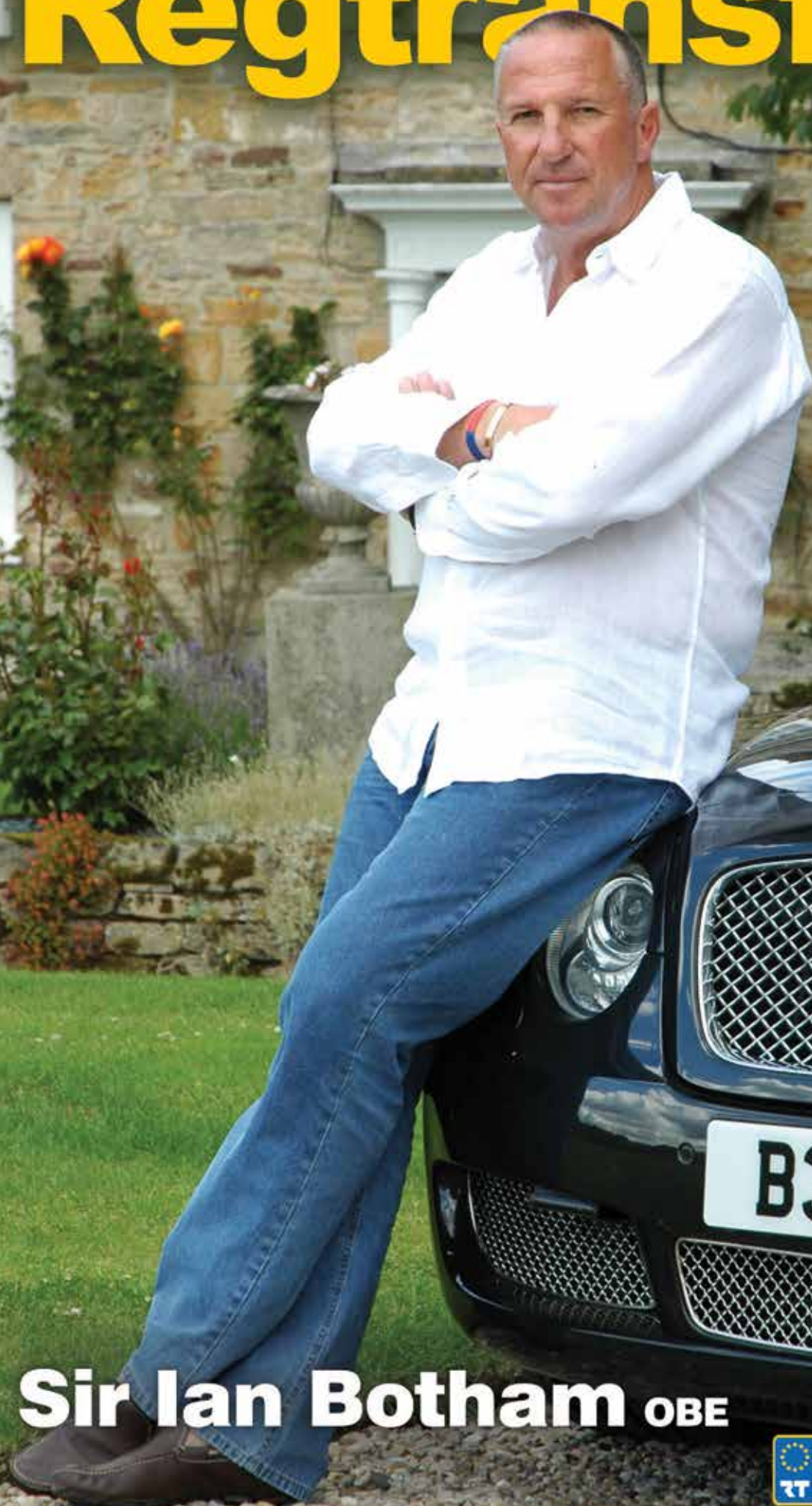
Sir Ian Botham OBE