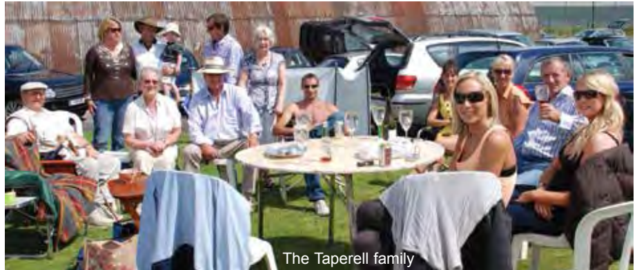
The Taperell family

Almost 100 vehicles arrived by early afternoon, a record attendance in recent years with the weather being kind until a heavy but, thankfully, short lived thunderstorm passed through. It was good to have many long time members come along and some new ones join us too. We