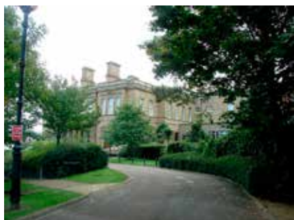
Oulton Hall, Leeds