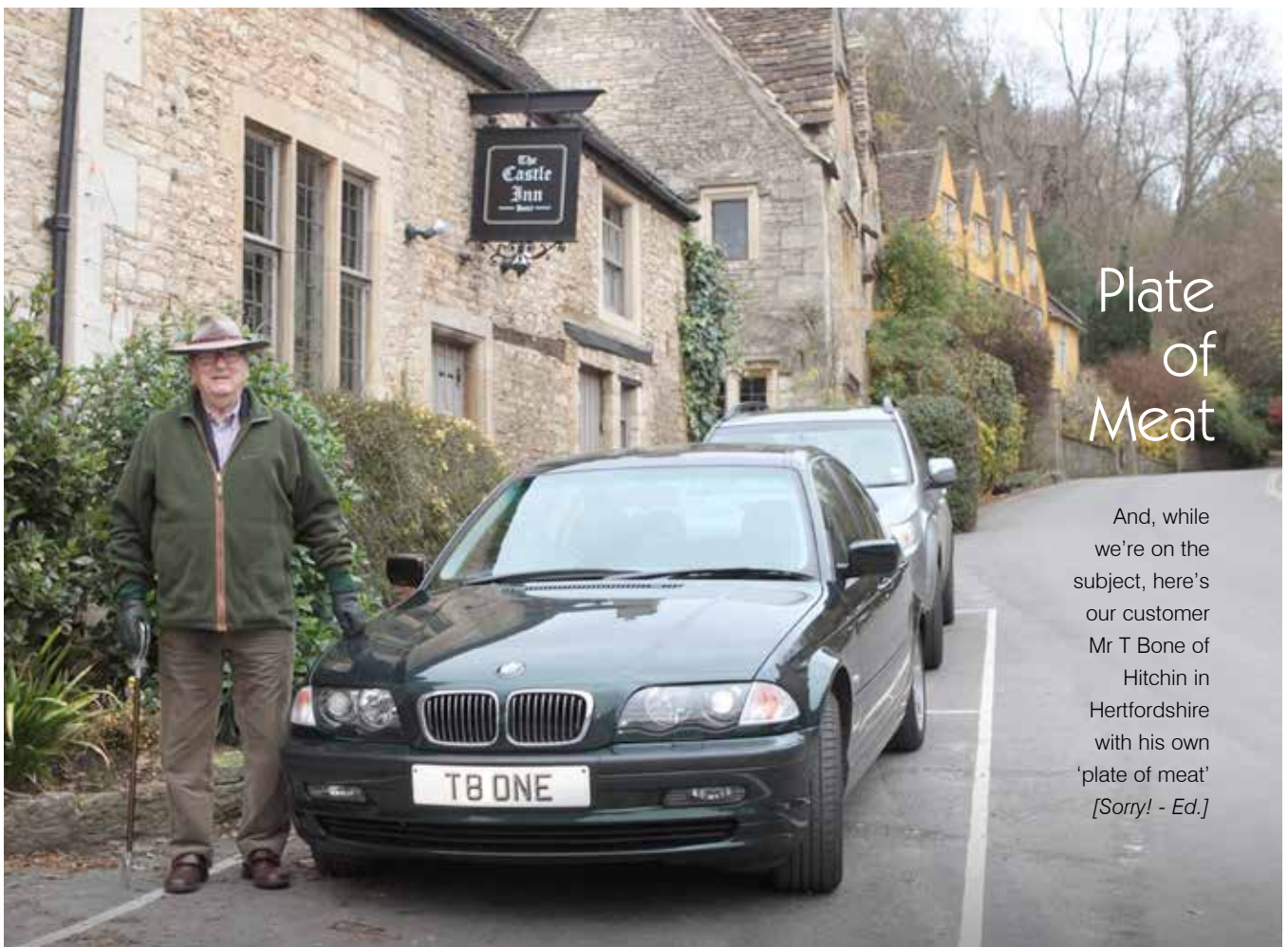
Plate of Meat